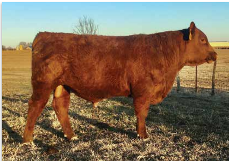
LOT 67 - CCC Elsa Merlin Blk 35