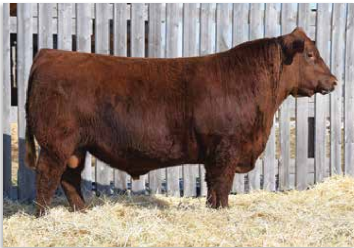
RED BLAIR'S SIGNATURE 6D - Service Sire to Lot 45