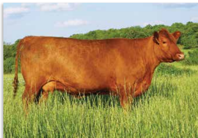
RRA FL JOANNA 10K 9104 - Maternal Granddam of Lot 10

LOT 10 JCCR JOJO 052H FALL OPEN HEIFER BD: 10/9/20 Reg: 4397357 Cat: A