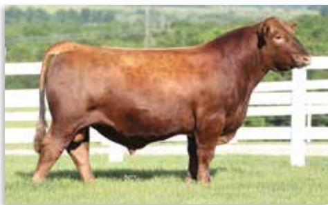
TW BULLS EYE 715E