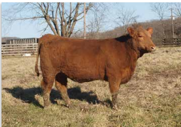
LOT 30 - RLS C134 Bertha 983