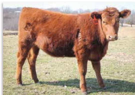
LOT 17 - EWRA Ms Takeback NB H164