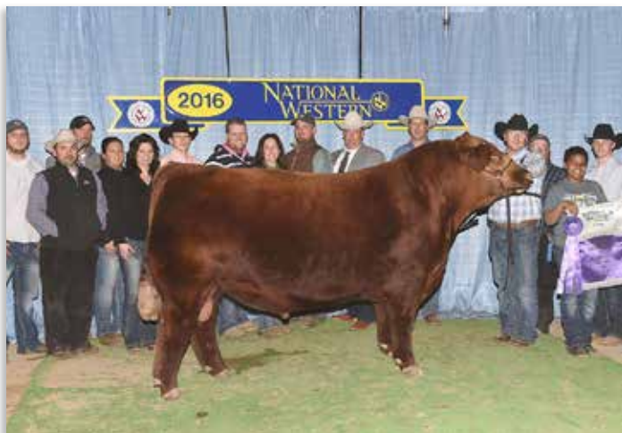
SIX MILE TAURUS 519A - Paternal Grandsire of Lot 13