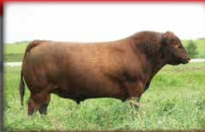
RED RINGSTEAD KARGO 215U Selling packages of 4 embryos of the KARGO x LULU mating