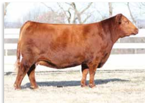
SBRX ZBEST Dam of Lot 52