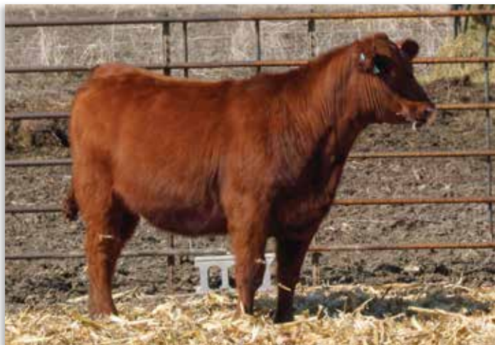
LOT 11 - 1PF Magnificent Lady