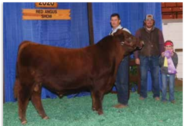
COUNTRY ACRES CHESAPEAKE 611 - Service Sire to Lot 34