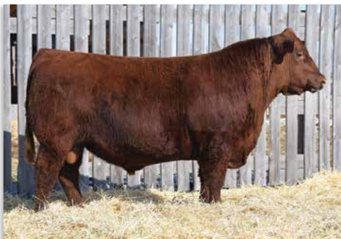
RED BLAIRS SIGNATURE 6D - Sire of Lot 64

WOW!! We are beyond excited to offer these potential herd-changing ET brothers out of breed legends Blair's Bingo 581B & GT Cita 4060! The sheer mass, eye appeal, and cat-like moves of Bingo commanded a $60,000 1/2 interest selling price, not once--but TWICE in his young career. Their dam Cita 4060 is arguably one of the most influential females in the breed. She is the dam of A.I sires PZC TMAS Firestorm 1800 and WR Mr. Forbidden 2514. She has produced two National Champion females and multiple purple-ribbon progeny across North America. Her genetics are so sought after that embryos peaked at $4500 EACH and a single flush sold for $20,000 in Denver 2016. In 2017 (at 13 years of age) she sold for $50,000 1/2 interest. This may be your only chance to make a buying decision that could make the kind of impact on your herd that these young studs offer. Don't settle on choosing between a bull to add pounds OR produce that next champion when you could have the best of both worlds...don't miss this rare opportunity! Retaining 1/2 semen interest. DNA tested--OSF. Follow Campbell Creek Red Angus for photos/videos closer to sale date.