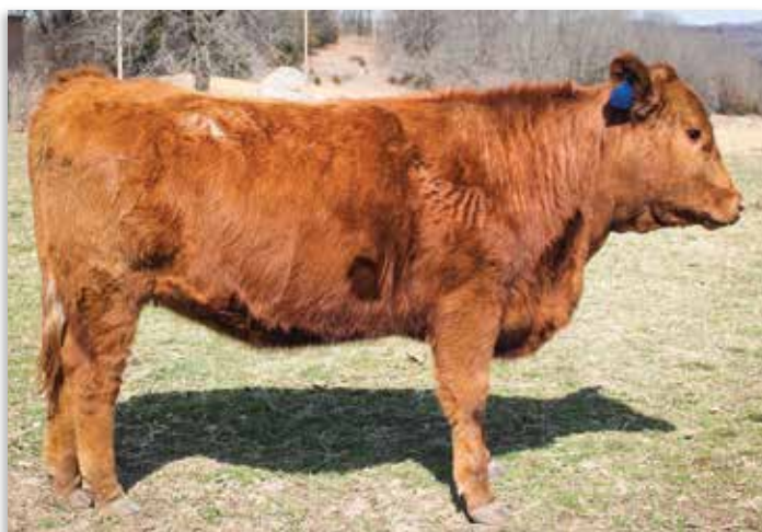
LOT 15 - EWRA Ms Conquest NB H158