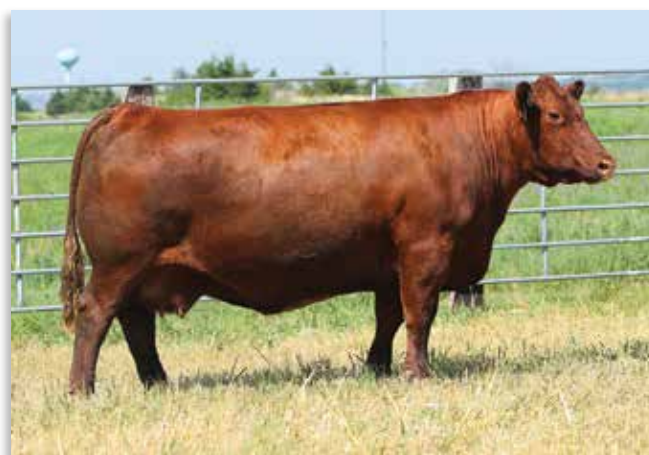
VAN WYE SPLIT ROCK 35X - Dam of Lot 9