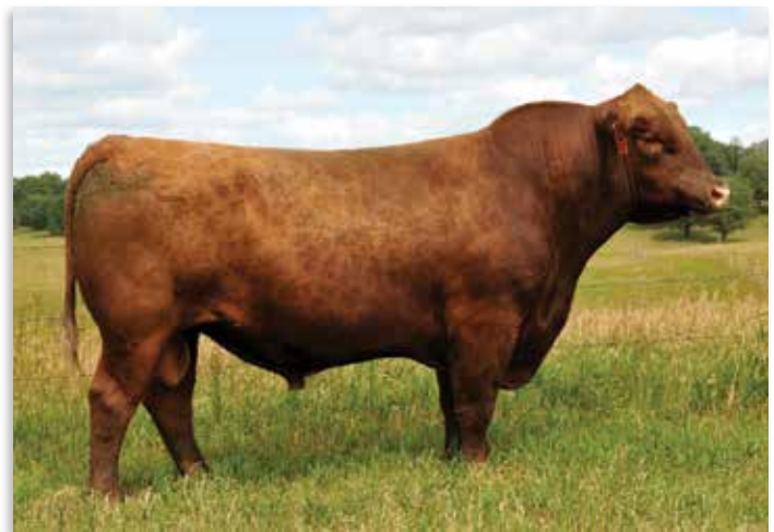
5L INDEPENDENCE 560-298Y - Paternal Grand sire of Lot 35