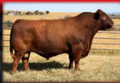
RED FINE LINE MULBERRY 26P Selling packages of 4 embryos of the MULBERRY x LULU mating