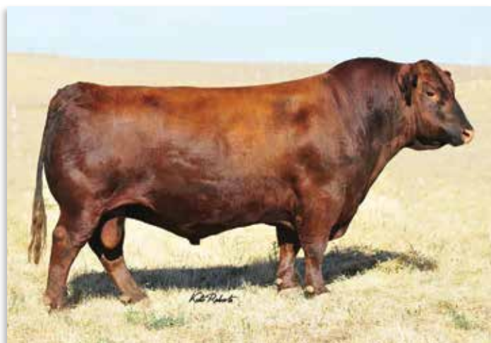
ANDRAS FUSION R236 - Paternal Grand sire of Lot 49