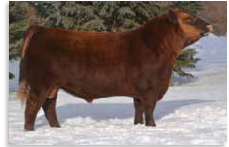
DAMAR TRUMP C512