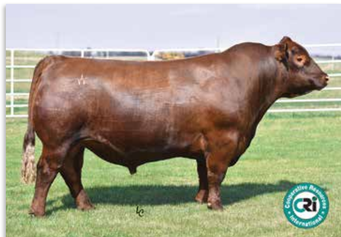
ANDRAS NEW DIRECTION R240 - Sire of Lot 41