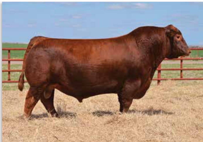
RED BLAIRS BINGO 581B - Sire of Lots 62 & 63