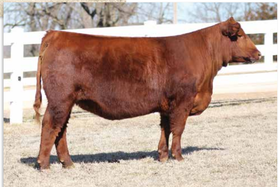
LOT 28 - TW 9X2 970G