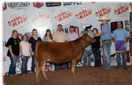
TW JILLIAN 986 G Grand Champion Female 2020 Ozark Empire Fair Class Winner 2020 American Royal