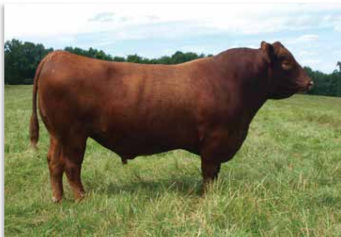
R4RA MULBERRY 155 - Sire of Lot 107-114 Females