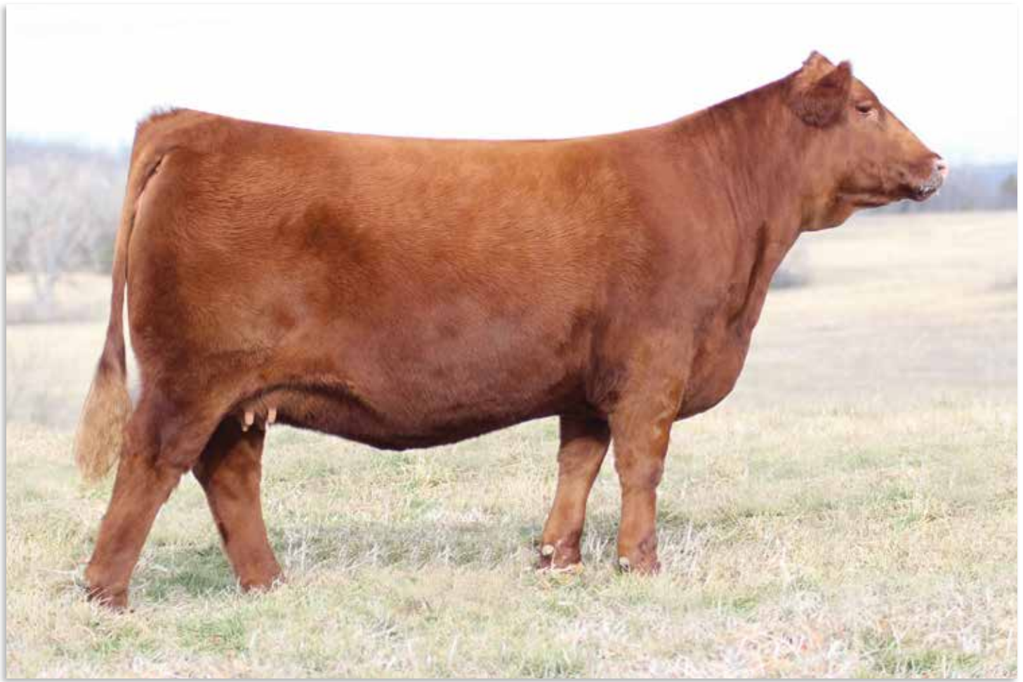
LOT 1 - Donor

Selling two Genetic opportunities out of the 2013 National Champion Keifers Lulu Y55, Reg.#1425806. Lulu never misses and these two proven sires mated to her offer a rare opportunity to place genetics into your herd that should be so exciting. Whether it be in the show ring or in the pasture, we can't say enough positive things about this amazing cow. Her progeny have great phenotype and are easy doing and always excel in contemporary groups. Offering two lots of 4 IVF embryos; one out of the National Champion Mulberry 26P (1151261) and another lot of 4 embryos out of the proven cow maker, Ringstead Kargo 215U (1599311) sire. Semen is very limited on both of these proven sires and mated to the proven time after time Lulu Y55, they are sure to be great ones. Don't miss this rare opportunity!