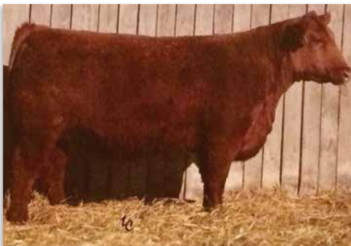
LOT 47 - Bieber Adelle 620D

This moderate cow was our pick of the Bieber Red Angus bred heifers sold in 2018, from the great Bieber donor Adelle 311Y. 620D was exposed to Red Blair's Signature 6D (#3920481) from Dec 1 - March 1, observed bred on 1-21-21. Breeding status available day of sale.