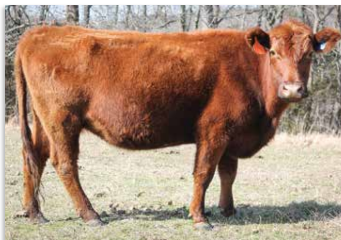
LOT 50 - Mushrush Pridegail JL C120

Mushrush Pridegail JL C120 (1745532) is a top notch female that came to us as a bred heifer from the impressive Mushrush herd with Beckton Julian X321 (RAAA#1382993) as her sire. She has raised 4 calves while here on the farm, 1 is a herd sire for us and her most recent heifer from 2020 will be available at the MORA fall 2021 sale. She was pasture exposed 7/1/20 - 11/1/20 and is bred to one of our herd sires, a Beckton Nebula P707 son, Mushrush Nebula C016 (RAAA#1745466) or a Beckton Nebula P707 grandson, EWRA Nebula Conquest E086 (RAAA#3737053). Pridegale received a full set of shots 3/6/21 including Covexin 8, Vira Shield 6 + VL5 HB Somnus.