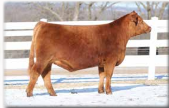
TW JILLIAN 986 G Selling 1/2 interest