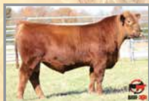
LACY Mov'n On Semen sells (#4237524)

Help support the next generation of Red Angus Producers!