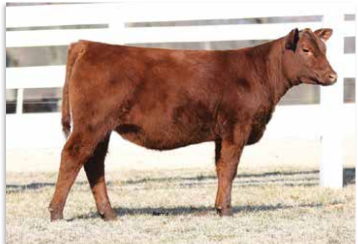
LOT 6 - TW Katya 056H