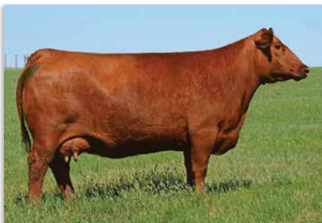
WCR MISS CORA DE 867Z - Dam of Lot 8

Being part of the fastest growing breed in the nation, it's not unusual to talk to folks wanting to get started or grow their Red Angus herd. With that in mind, we wanted to consign a unique "Herd-Building" opportunity! Choose one, two, or all three of these Fall open heifers to get your program off to a running start with some of the breed's most sought-after genetics. Buy with confidence knowing that these three heifers, who all rank in the top one-third of the Herdbuilder index, will put you on a path to building your herd with proven maternal traits that Red Angus are best known for. Follow Campbell Creek Red Angus for photos/videos closer to sale date.