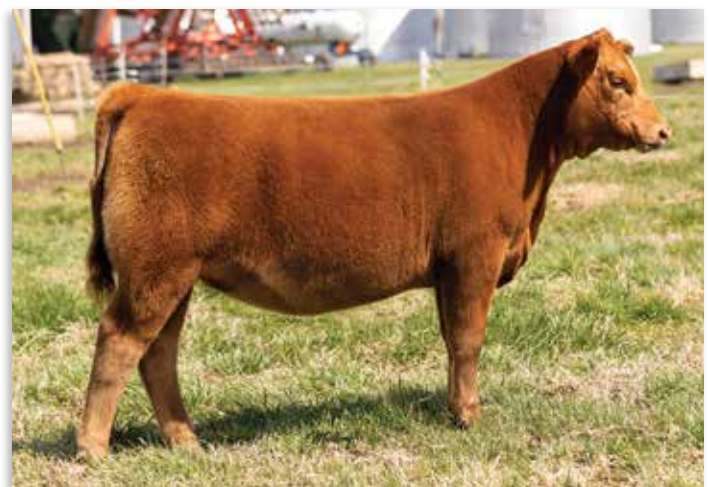
LOT 7 - MCL Annie 016D 0539