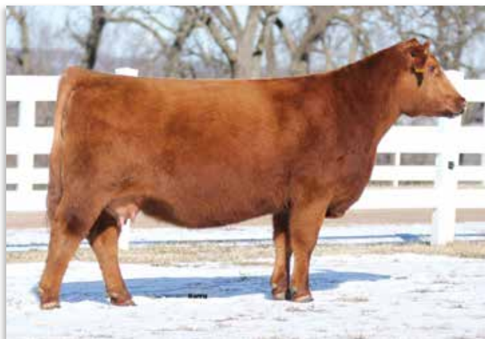
LOT 51 - AA Moonlight Serenade