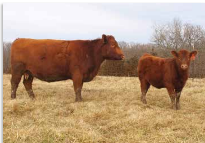
LOT 53 - RLS 155 Cameo 628