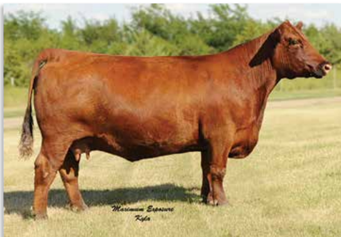
GT CITA 4060 - Dam of Lots 62 & 63