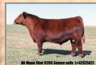
Alt Moon Shot 920G Semen sells (#4207562)