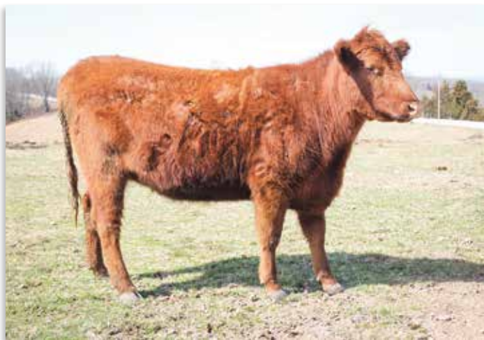
LOT 33 - EWRA Monu NB G137