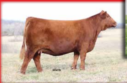
KEIFERS LULU 55Y Donor

Other investment opportunities for these matings offered upon inquiry.