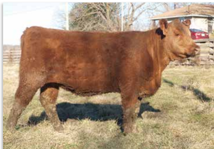
LOT 31 - RLS A163 Ellie 935