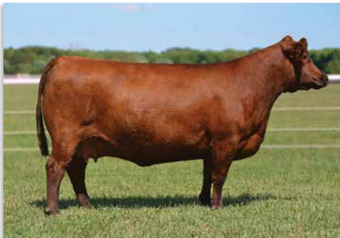
GRNA MISS MULBERRY 920 - Dam of One Heifer Option