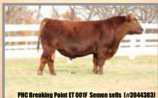
PNC Breaking Point ET 001F Semen sells (#3944383)