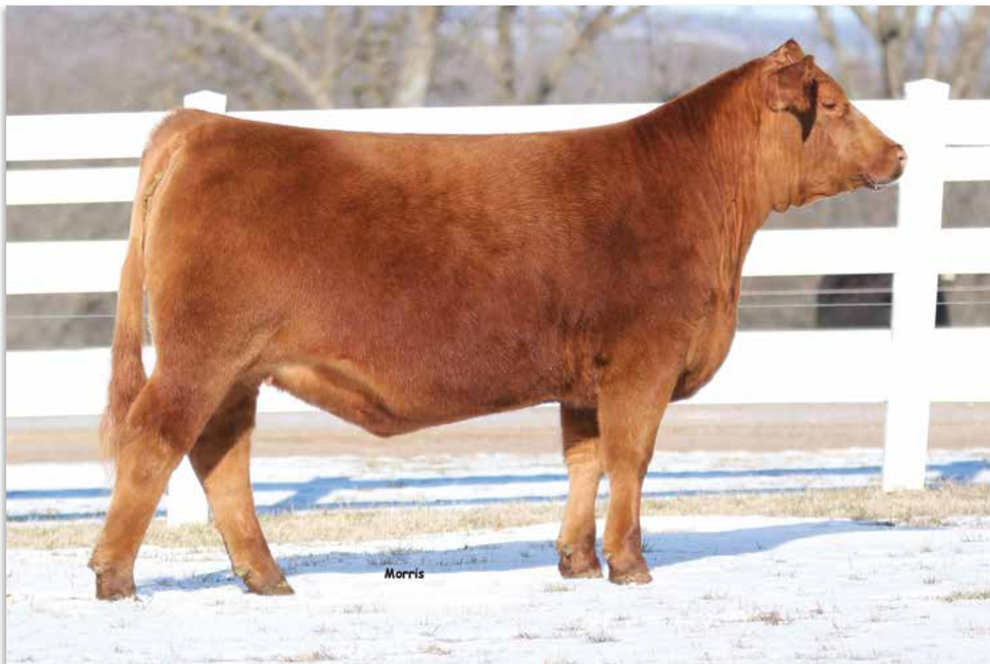
LOT 26 - TW Jillian 986G

WOW! From the heart of the Twin Willow Show and Breeding program. She's a daughter by Gravity 296E out of one of our favorite cows that we purchased out of the Damar herd. "DAMAR Z289 JILLIAN Z405". She's a great one! We love this heifer and her dam. This heifer has real breeding potential. She was Grand Champion female at the Ozark Empire Fair 2020. She's PE to Red SSS Tycoon son out of one of Twin Willow's top cows we used this year. TW Tycoon 931G 4182526. Selling half interest in this amazing young heifer. Twin Willow will retain possession until after her show career is over. TW will pay for all expenses for her campaigning this next show season and we have high hopes for her. TW will want to place her into embryo transfer after she calves, and the costs will be split with the new partner. We are open to negotiations of possession and breeding options with our new partner as a cow and look forward to partnering with her.