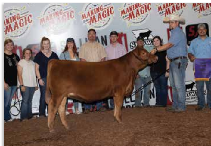
LOT 26 - TW Jillian 986G