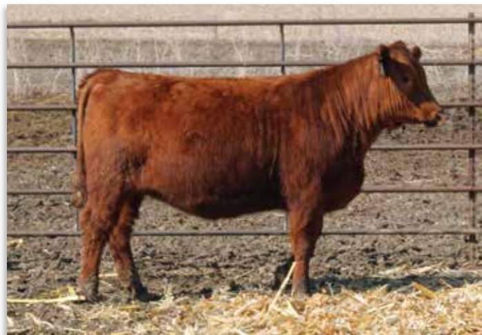
LOT 12 - 1PF Miss Fusion