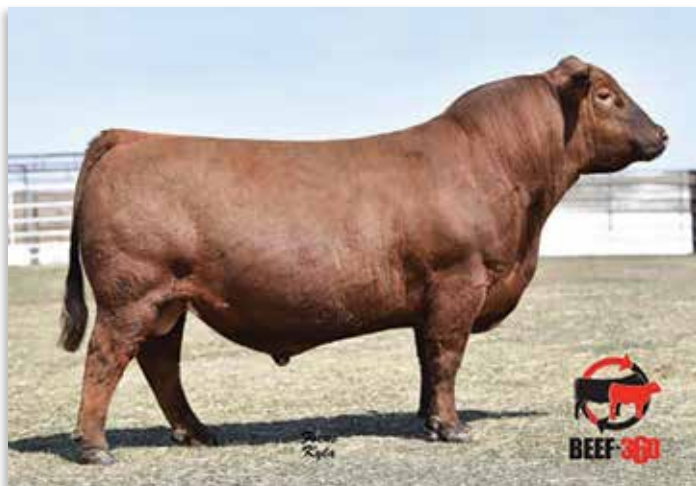
RAVN LINEBACKER C537 - Sire of Lot 19