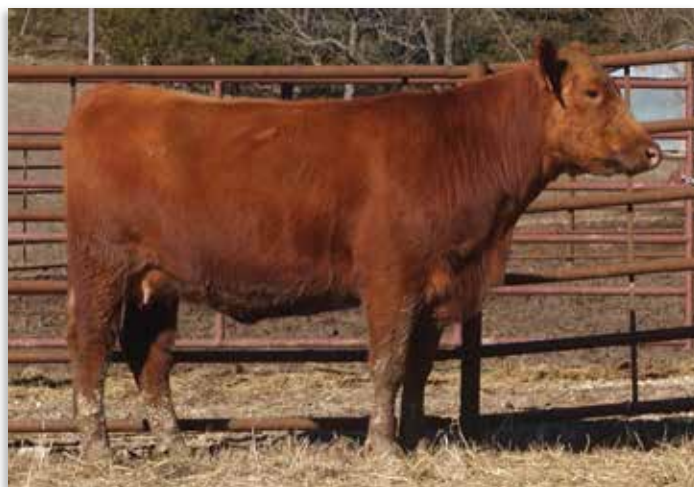
LOT 54 - RLS 5504C Robin 8148