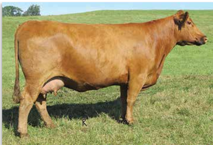
DFRA TARMILY N512 - Maternal Granddam of Lot 39