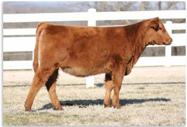
LOT 5 - TW Sara 054H