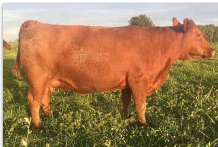
GJRA/LZYJ QUEEN POWER 3205 - Dam of Lot 48

We purchased 37E's dam--GJRA/LZYJ QUEENPOWR 3205 in 2017 at the Ft. Worth Showcase sale, and we are so glad we did. She has been a tremendous cow for us, and offering her daughter in the MO Red Angus sale was a hard decision to make. 37E has a nice son in our bull pen. 37E was exposed to Red Blair's Signature 6d (#3920481) from Jan 1 - March 1, and observed bred on 1-12-21.