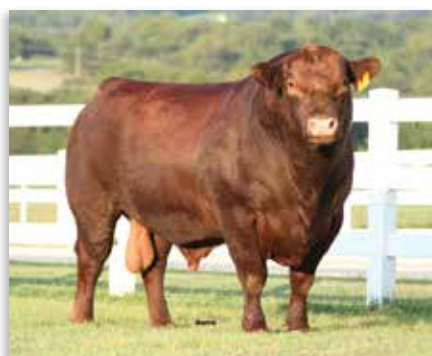
RED SIX MILE CAR LOAD 275D Sire of Calf at Side of Lot 51