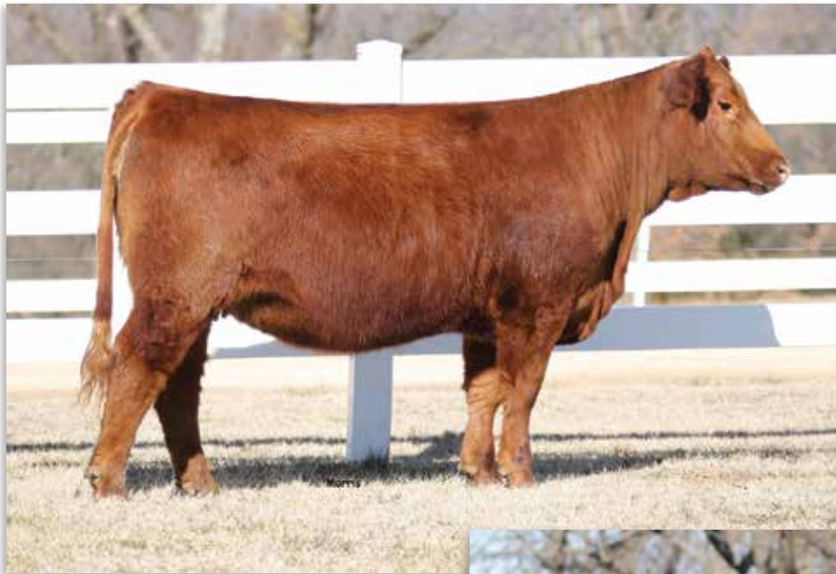
LOT 27 - TW Fayet 966G