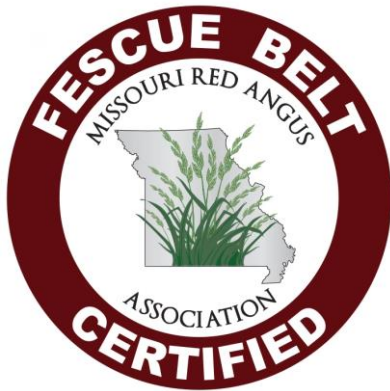
Official MORAA Fescue Belt Certification Logo

The Missouri Red Angus Associations Board of Directors recently approved the “Missouri Red Angus Association Fescue Belt Certified” program as an initiative designed to promote Missouri Red Angus members genetics.