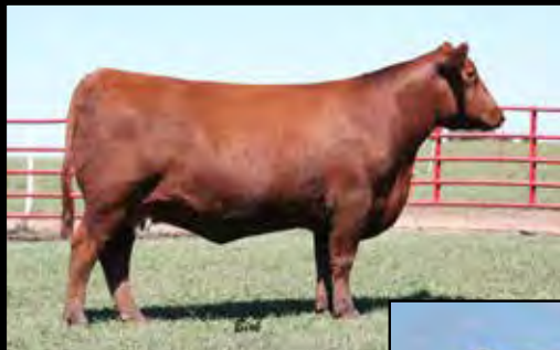
PCHFRK PRINCESS RIGHT KIND B806