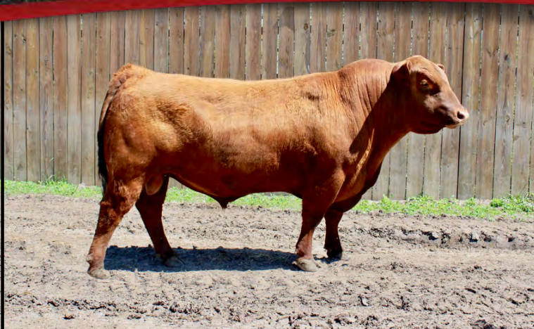
BACH MR CRACKERJACK F111E, sire of Fall bred heifers