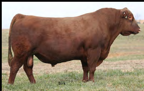
Sire: BACH COMMANDER ET12A

***Package of 5 embryos priced at $250 each or $1,250 total.***