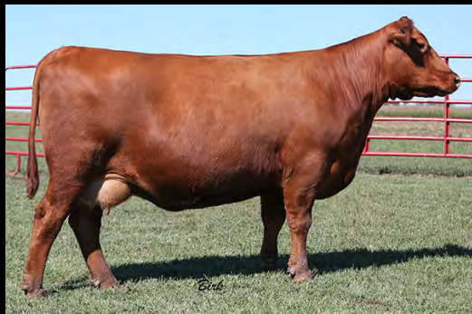
BROWN MS P707 Y7741