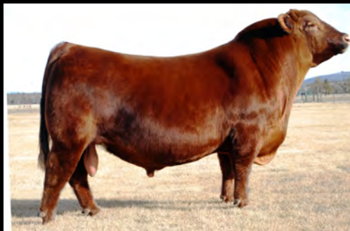
9 MILE ONE OF A KIND 6129

***Package of 5 embryos*** priced at $250 each or $1,250 total