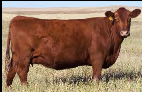
Dam: BJR BONNELL 504C