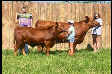
Bieber Adelle 184B and MIGHTY MO son