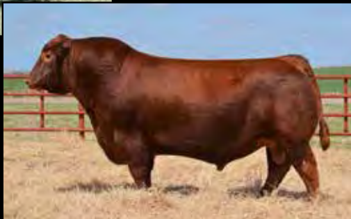
RED BLAIRS BINGO 581B