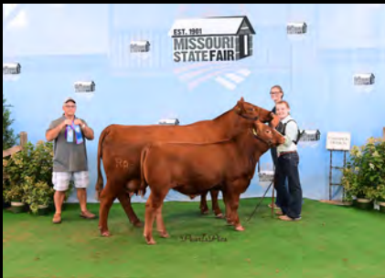
Mo State Fair Champion pair