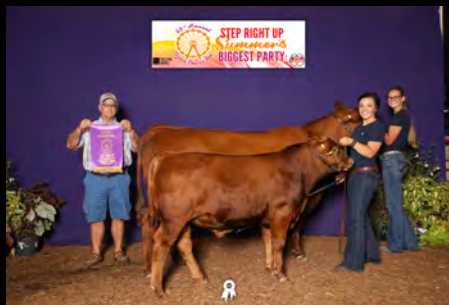
2019 Champion female Ozark Empire